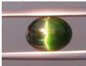
Chrome Diopside (cat's eye)

It should be noted that the term cat's eye always refers to the mineral Chrysoberyl. However there are other minerals which exhibit this effect. Such as Tourmaline, Quartz, Tiger Eye, Zircon, and Moonstone