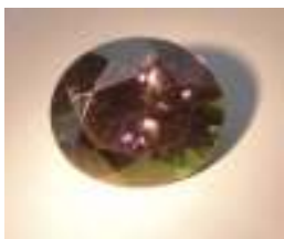
Color Change Tourmalines, Brazil