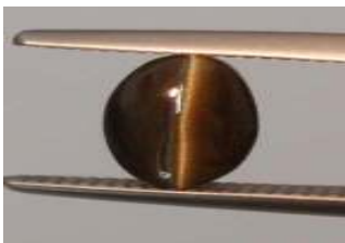
Kornerupika ne (cat's Eye), Sri Lanka

A star may have four, six, or 12 legs (rays) radiating outward from a central point. They will also follow the light source as it travels over the surface of the stone. To fully exhibit this effect, gemstones or minerals need to be cut en cabochon , a style that has a dome-like appearance on top. While many minerals and gemstones exhibit stars, some are extremely rare and highly prized by collectors and jewelry designers. Stars can be found in Quartz, Garnet, Sapphire, Ruby, Scapolite, Spinel, and Diopside.