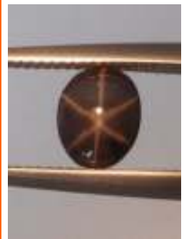
Spinel (Sri Lanka)