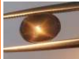
Scapolite (Sri Lanka)