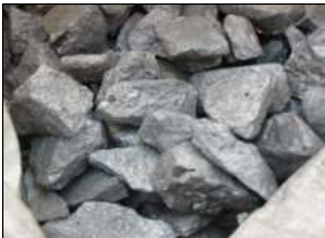
(2) Ferro Silicon (Tian Jin, China)

you consider that 25% of the Earth's crust has silicon in it. Silicon binds strongly with oxygen and is usually found as silicon dioxide (quartz) or as a Silicate ( \text{SiO}_4 ). Native Silicon has been found in volcanic exhalations (emissions) and sometimes as tiny inclusions in gold. Silicon can be found in rock shops as end fragments of silicon boules, discarded by the integrated circuit industry. The unused parts of the boule are often saved, and used as decorative items.