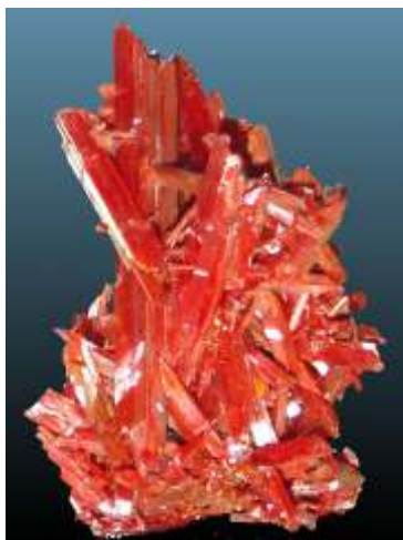
(1) Crocoite Adelaide Mine, Dundas, Tasmania

Almandine , is the most common of the garnets, this Iron Aluminum Silicate, is usually found in garnet schists (metamorphic rock composed mostly of mica). Transparent crystals are frequently cut into gemstones.