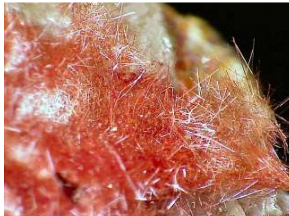
(7) Cuprite Christmas mine, Gila, Arizona

ide. Furthermore it derives its name from the latin Rutilus, red, in reference to the deep red color observed in some specimens when viewed by transmitted light. Small rutile needles present in gemstones are responsible for asterism. Asterated gems are known as "star" gems, such as Star Sapphires, Star Rubies, Star quartz, Star Garnets, and the various other stars.