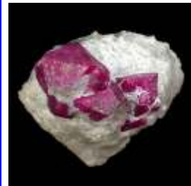
(4) Corundum Jagdarak Ruby Mine, Sorobi District, Konar, Afganistan