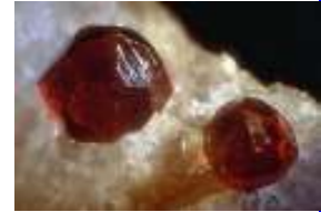
(2) Almandine Fanny Gorge Mine, Spruce Pine, NC

Rhodonite is an attractive mineral that is often carved and used in Jewelry. It is a Manganese Iron Magnesium Calcium Silicate and named after the Greek work for rose, Rhodon. Its rose-pink color is distinctive and can only be confused with rhodochrosite. Rhodonite does not react to acids and