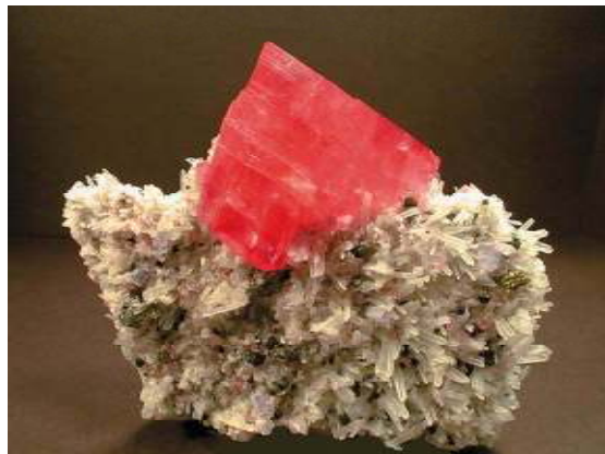
(8) Rhodochrosite Rivas Pocket, Sweet Home Mine, Alma, Colorado