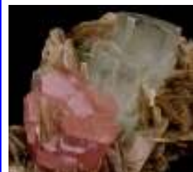
(5) Pink Fluorapatite, Aquamarine on Muscovite Nagar area, Gilgit district, Pakistan