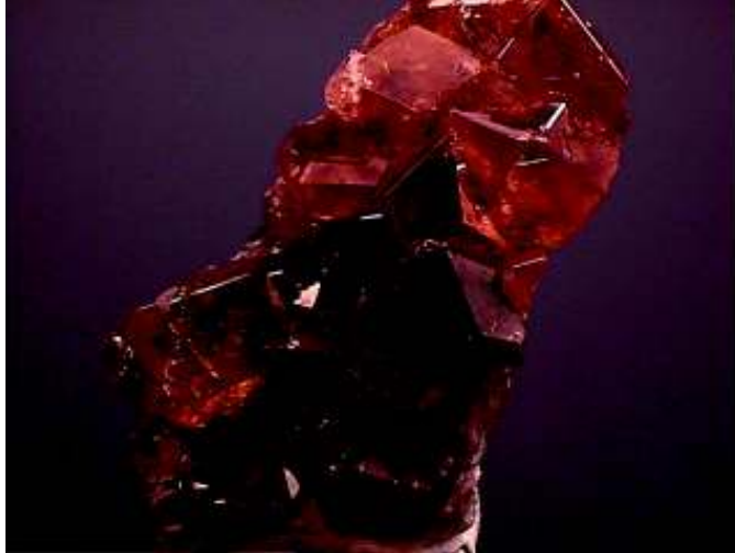
Melanite Garnet, El Azabache Mine, Lazaro Gardenas, Chihuahua, Mexico