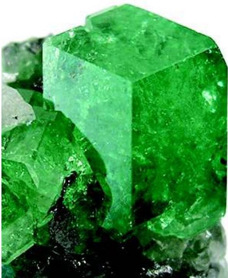
Color Change Garnet, Tanzania

Tsavorite Garnet, Merelani Hills, Arusha, Tanzania