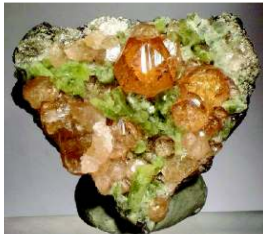
Grossular Garnets with Vesuvianite, Jeffery Mine, Quebec, Canada

We had a lovely 2011, and we wish all of you a wonderful 2012. Hau'oli Makahiki Hou!