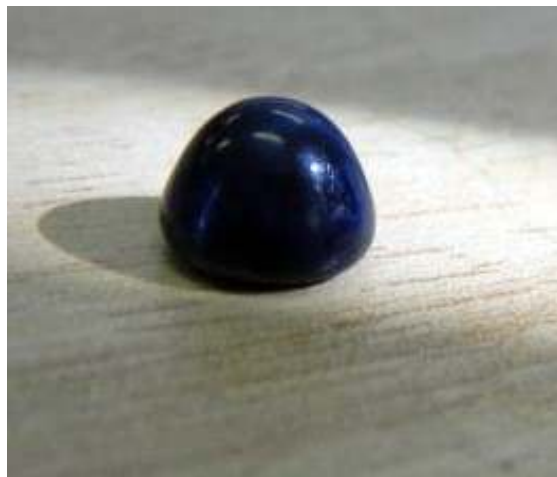
Hudson Strait Pearl of Blue Mussel

North American freshwater pearls went almost unnoticed until the mid-1800s, when reports started to arise of people finding spectacular pearls in rivers and streams around the United States. These discoveries triggered the beginning of large-scale harvesting for these pearls at first, and for the mother-of-pearl later. This was used in buttons, and today for the mussels are harvested for the shells to produce nuclei for cultured pearls.