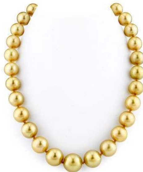
Gold Pearl Necklace (Philippines)

Gold South Sea pearls are among the rarest pearl produced in the world today. Their golden colors are completely natural, being produced by the gold-lip variety of the Pinctada maxima pearl oyster. They are grown primarily in Australia, the Philippines, and Indonesia, and the Philippine pearls are darkest in color